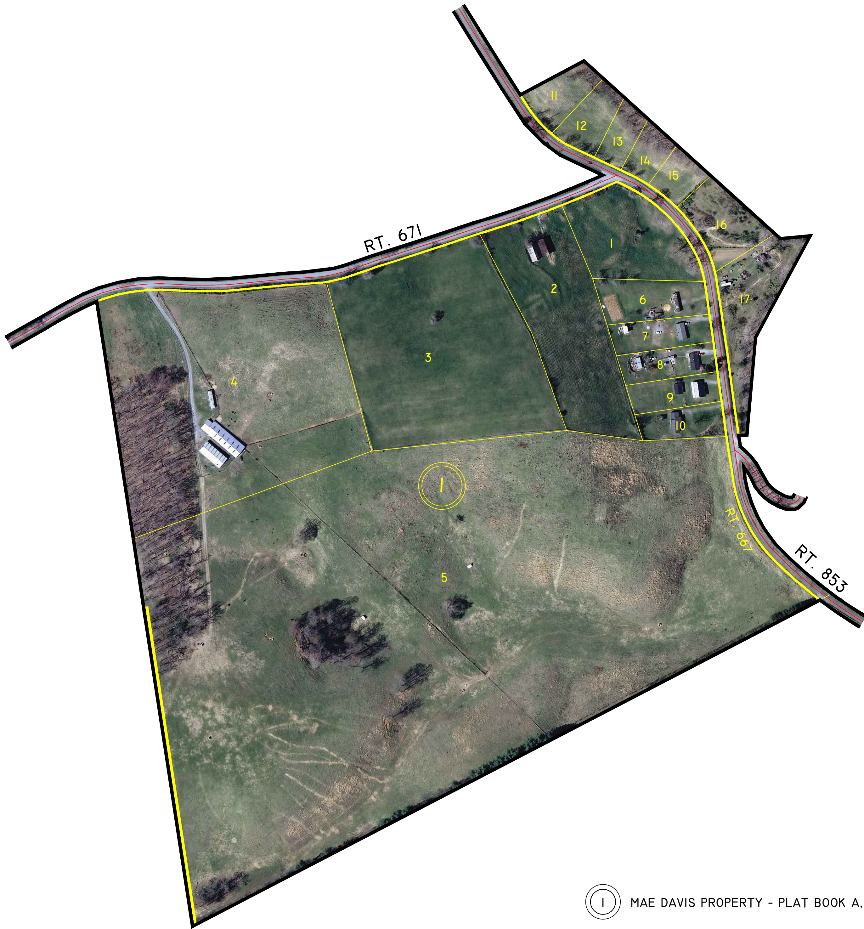
① MAE DAVIS PROPERTY - PLAT BOOK A, PLAT SLIDE 061