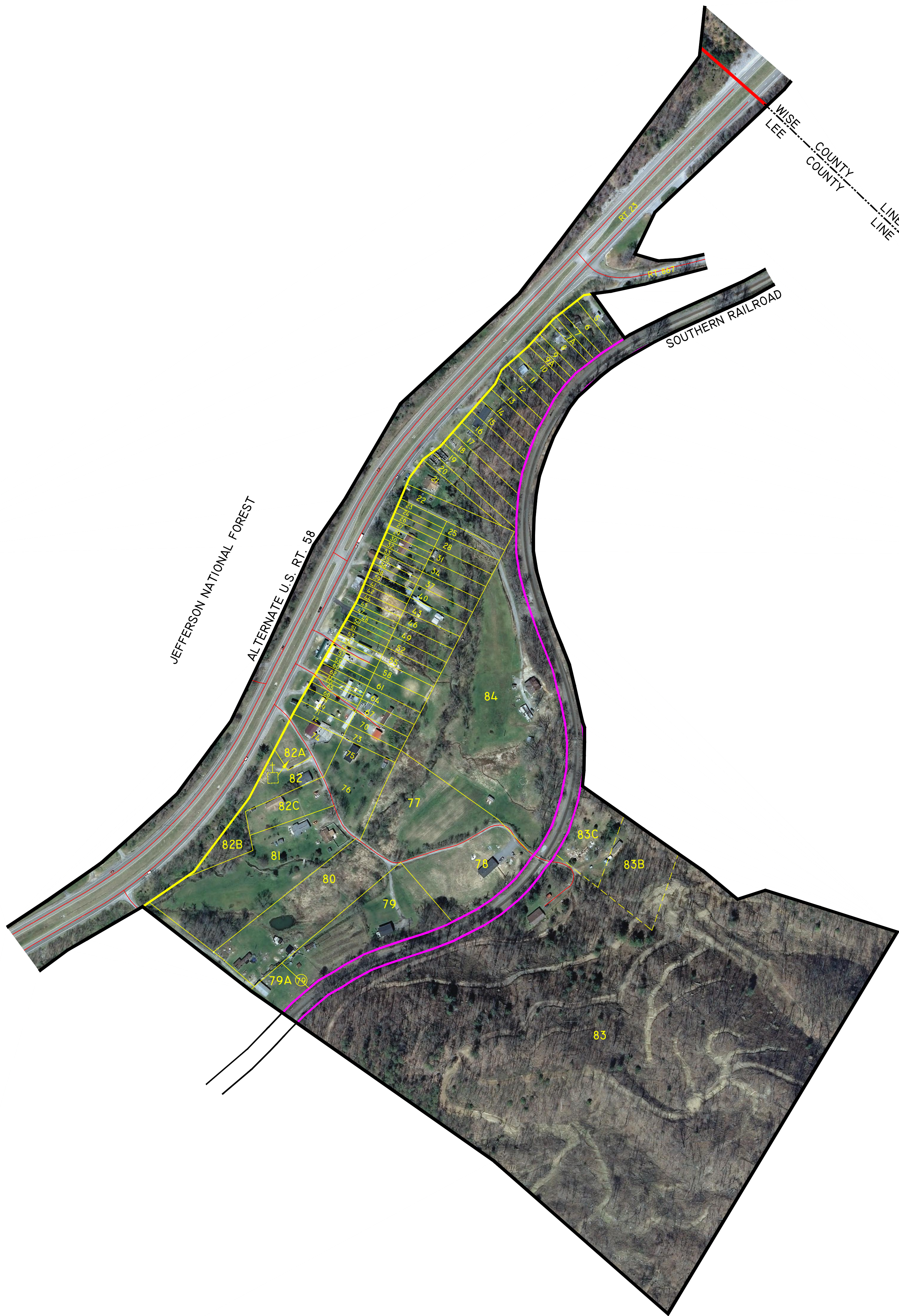
① F.H. McCRACKEN FARM - PLAT CABINET B, SLIDE 185